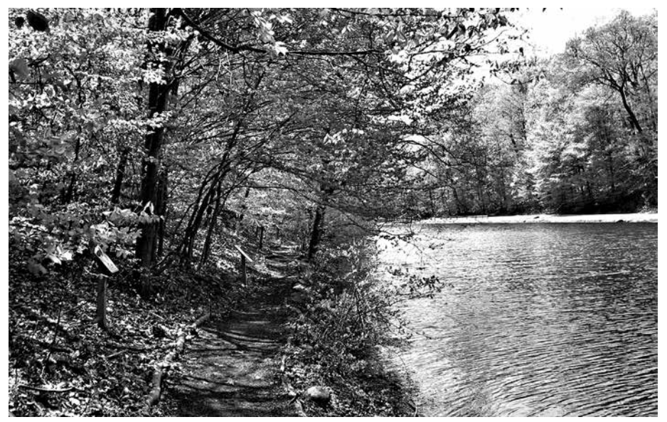
At the pond.

lot to a fishing pier and then parallels the road behind a wooden barrier. It ends at a pull out for 3-4 cars south of the lake. The 9/11 Trail goes 0.1 mile to a memorial to the town residents killed in the attack on the World Trade Towers. An unmarked fire access road goes 0.2 mile to the cul-de-sac at Barnes Lane.